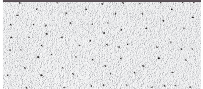
Fine-textured panel - Perforated